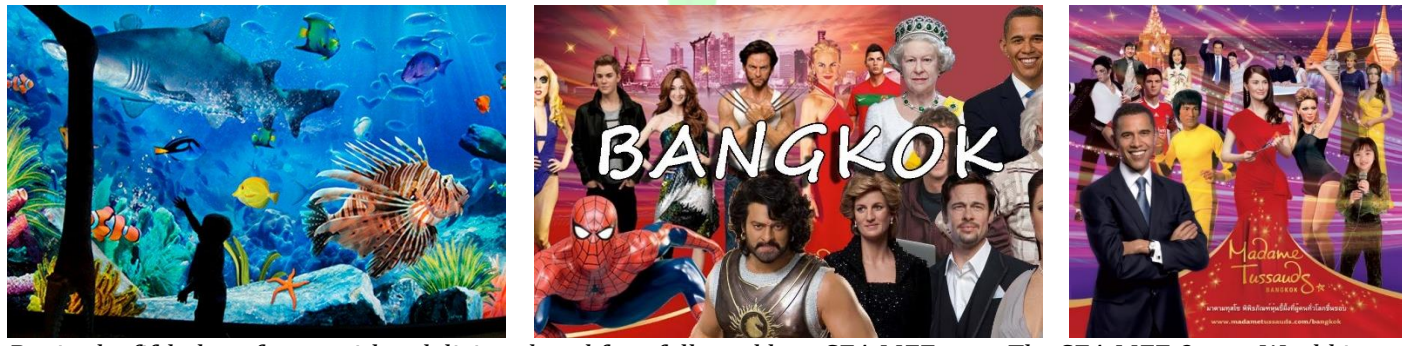
Begin the fifth day of your with a delicious breakfast, followed by a SEA LIFE tour. The SEA LIFE Ocean World is home to a variety of underwater world species. You will witness a plethora of adventures and breathtaking sights. Next, you will move to Madame Tussaud's and see wax statues of movie legends, historical icons, and Local Thai stars, and popular Singers.