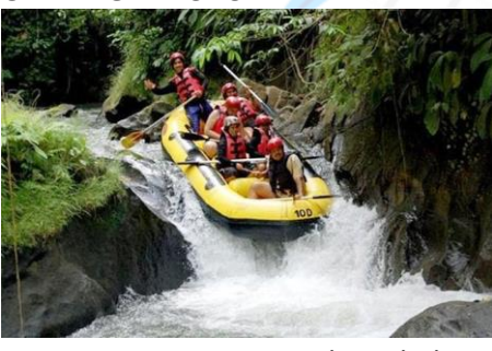
DAY 3 WHITE WATER RAFTING OVERNIGHT: UBUD

As this day arrives at an end, return to your hotel and retire for the night.