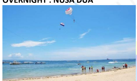
DAY 5 ENCHANTING LOCAL SIGHTSEEING AND WATERSPORTS OVERNIGHT: NUSA DUA

Set the day in motion with an appetizing morning meal and check-out from the hotel as today you will be departing for Nusa Dua. Post completion of check-in formalities, relax for some time to get over the travel fatigue. In the evening, make a visit to the Puja Mandala where you can offer prayers and get to know about the cultural and religious history of Indonesia. Later, you can spend the evening as per your plans. Once done, return to the hotel for a cozy overnight slumber.