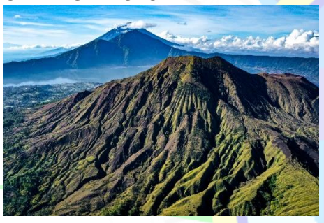
DAY 2 KINTAMANI VOLCANO TOUR OVERNIGHT: UBUD

Reach hotel and post-check-in, spend some time unwinding and planning the latter half of the day. Set out to explore the scenic natural gems, contemporary attractions or solemnly pay a visit to the famous temples. Spend the evening strolling around the shimmering streets and bustling markets, and don't forget to dine at the popular restaurants for a great culmination of your day. Afterward, return to your hotel and get a reposeful sleep.