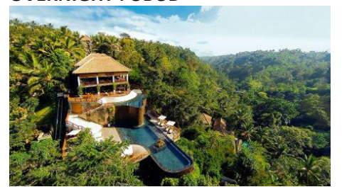
DAY 1 UBUD ARRIVAL OVERNIGHT : UBUD