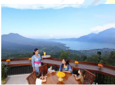
Kintamani Viewing Point to see Mt. Batur

Learn a completely new art form called Batik Making, which will enhance your creativity. Learn from the experts and master this traditional Balinese artwork for yourself. This project will teach you about the numerous processes for creating the art, as well as the various tools and colourful dyes that are used to create the perfect Batik Artwork. As a memento of this lesson, keep the Batik art that you created. Make lasting memories while participating in this activity.