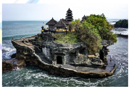
Tanah Lot Temple