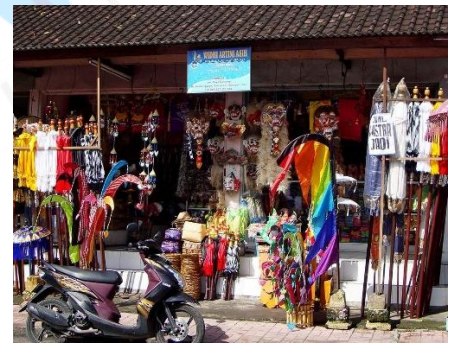
Guwang / Sukawati Art Market

The Tegenungan Waterfall, located in Kemenuh Village on the Petanu River, is one of Bali's most popular tourist destinations. The waterfall cascading from a height of about 66 feet is a breathtaking sight to behold. Nestled amidst a lush tropical jungle, this hidden spot is sure to leave you speechless. A few steps down the concrete steps and the safety rail take you to the bottom of a waterfall. Along the way down, there are several viewpoints from where you can take in the scenery and scenic picture spots where you can snap some magnificent sceneries.