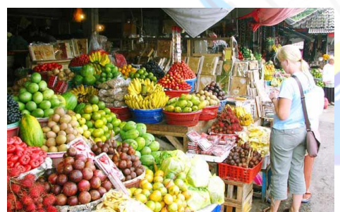
Candi Kuning Traditio<mark>nal</mark> Market

Explore the tropical island of Bali which is covered by lush green paddy fields, sacred waters, valleys, and rivers with this full-day Bedugul tour in Bali. Explore the prominent attractions in Bedugul, including Taman Ayun Temple, Luwak Coffee Plantation, Bali Botanical Garden, Ulun Danu Beratan Temple in Beratan lake, and Handara Iconic Gate. You will be accompanied by an English-speaking driver cum guide throughout the experience. The package also includes a scrumptious Balinese lunch at a local restaurant.