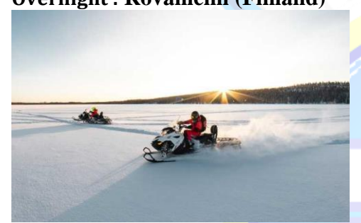
Day 2 Snowmobile Riding Overnight: Rovaniemi (Finland)