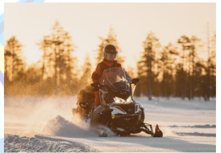
Start your week with an unforgettable snowmobile safari in the wilderness. This trip a brilliant opportunity to take pictures of the breathtaking vistas. Enjoy a light lunch at an open fire. Overnight Rovaniemi.