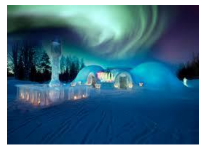
Welcome to Lapland - the top of the world! Transfer from the airport to the safari office where you get your adventure kit. Once you've collected your gear you are taken to your hotel. Overnight Rovaniemi.