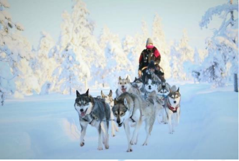
Day 6 Husky Safari Overnight : Rovaniemi (Finland)

All day reindeer adventure today. Let's go and meet the reindeer herders! These people are real wilderness survivors. The program can vary anyway depending on the weather conditions and month. Take your own Reindeer driving license! Light lunch during the day. In the afternoon, visit an ice restaurant. The Ice restaurant is available December - March only! Overnight Rovaniemi.