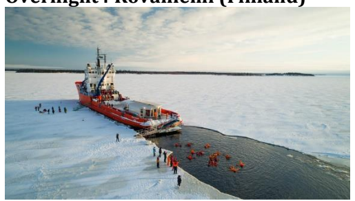
Day 7 Free day or take an optional excursion Overnight: Rovaniemi (Finland)

Today make a half day trip to visit a Husky farm . First receive briefing about Husky driving and Husky training. Enjoy a 2 hours safari in the wilderness, you may drive yourself. True highlight of your tour! How about skiing? Take part in an easy skiing trip on good tracks. This is the best way to get around in this part of the world. Light lunch is offered during the day. Overnight Rovaniemi.