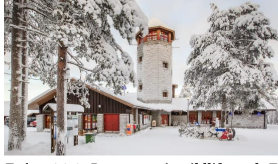
Day 3 Raunua Arctic Wildlife Park Overnight: Rovaniemi (Finland)