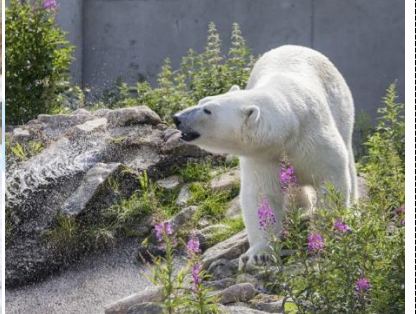
Today visit in Ranua arctic wildlife park . The wildlife park is a large and natural arctic animal park. Here you can see polar bears, wolfs, wolverines, lynxes, owls and other interesting animals and birds. Visit also the local berry wine shop, local sweet shop and souvenir shop. Light lunch included. Often you see also wild reindeers on the way there! Overnight Rovaniemi.