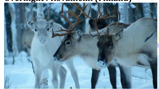
Day 5 Reindeer Adventure Overnight: Rovaniemi (Finland)

Today experience the wilderness on an easy snowshoe trek and ice fishing . Make ice holes with a special ice drill and fish trough these holes. Light lunch by open fire. Tonight it's Aurora hunting (Northern lights) by car and on foot. Admire this fantastic natural show and experience some local traditional shamanism. The visibility depends on the conditions. Barbeque included. Good luck! Overnight Rovaniemi