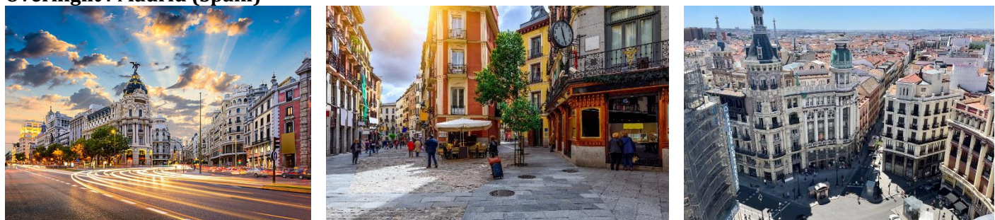
Welcome to Madrid! Upon arrival at Madrid Airport, meet your car and transfer to the hotel. Check in and spend the rest of day at leisure. Overnight Madrid.