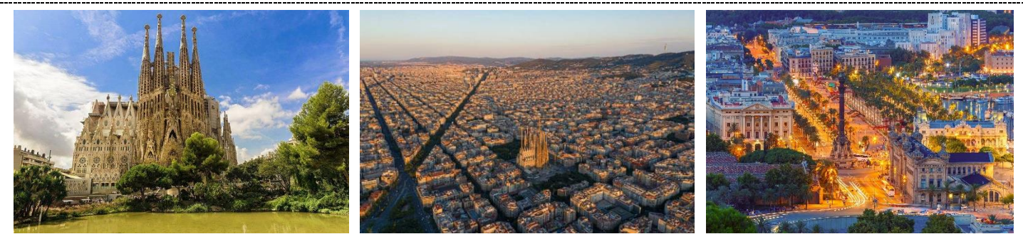
Meet your driver after breakfast and take your private transfer to the train station in Madrid. Board a fast train and relax on your way to Barcelona. They journey takes circa 3 hours. Welcome to Barcelona! Upon arrival at Barcelona Train Station meet your car and transfer to the hotel. Check in and spend the rest of day at leisure. Overnight Barcelona.