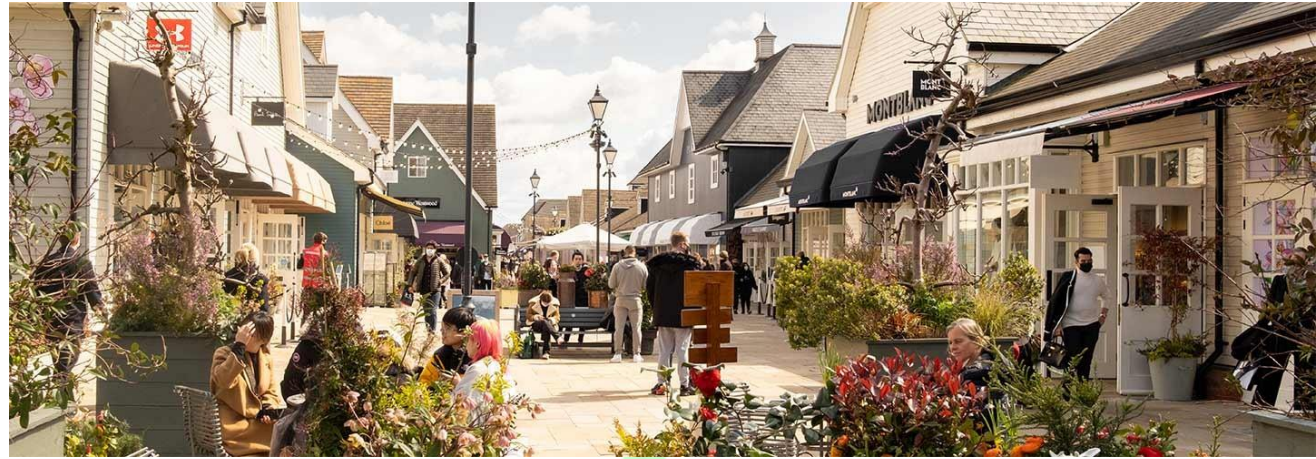
Breakfast at the hotel. We then travel towards Bicester Village for shopping at the Factory Outlets, where you can get your hands on some of the best brands in the world at their lowest prices. We travel back towards London. Time at leisure in Oxford street. Drop off at your hotel for an overnight stay.

Day 4 Transfer London to Paris Overnight: Paris (France)