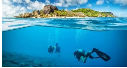
Scuba Diving at L'ilot