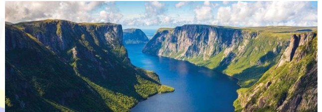
Explore Rich Diversity Of Flora And Fauna at Morne National Park