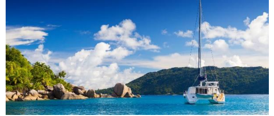
Seychelles Island Hopping Tour by Cruise