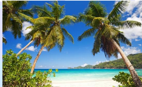
Beau Vallon Beach