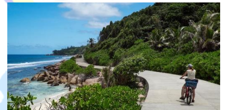
Cycle around La Digue