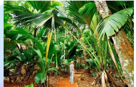
Vallée de Mai National Park