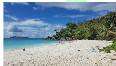
Hike Around Anse Georgette Beach