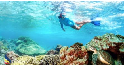
Snorkeling at Bird Island