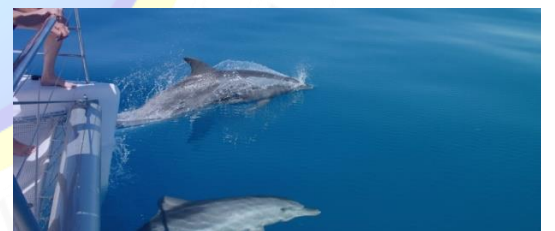
Sipping Champagne While Watching Dolphins On A Boat