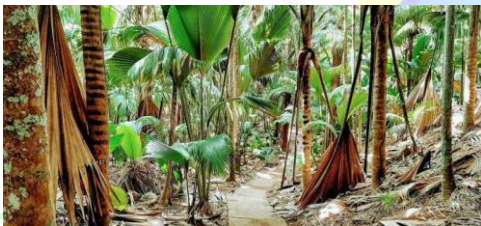
Vallee De Mai Tour