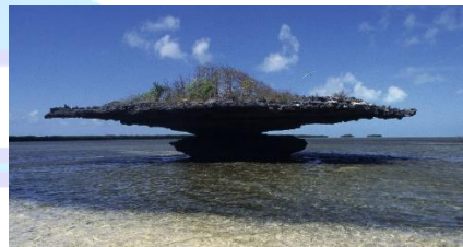
Visit Aldabra - The World's Second Largest Raised Coral Atoll