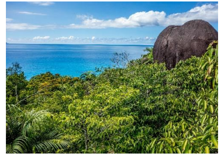
Morne Seychellois National Park