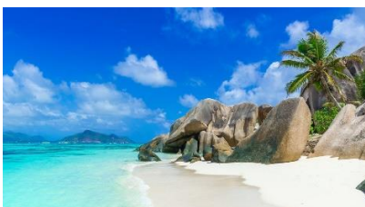
Sunbathing at Anse Source D'Argent