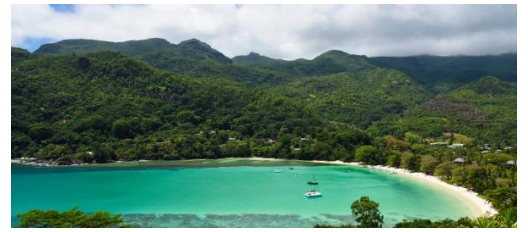
Kayaking at Port Launay