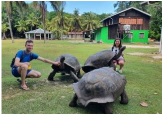
Meet Giant Tortoises On Curieuse Island