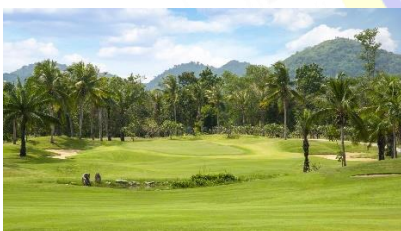
Golfing at Seychelles Golf Club