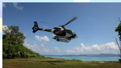
Take a Helicopter Tour of Seychelles