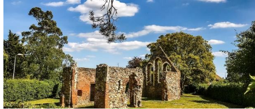
Explore The Ruins Of The Leprosarium