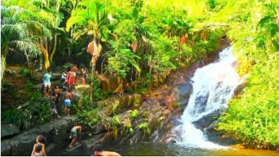
Secret Waterfall – Praslin