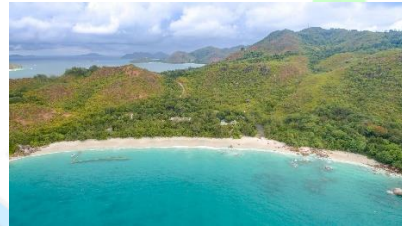
Gaze at The Famous Beach, Anse Lazio