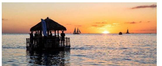
Go For Sunset Cruises at Cousin Island