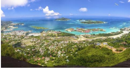
Explore The Famous Mahe Island