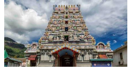
Plan A Visit To A Famous Hindu Temple, Tempio Hindu