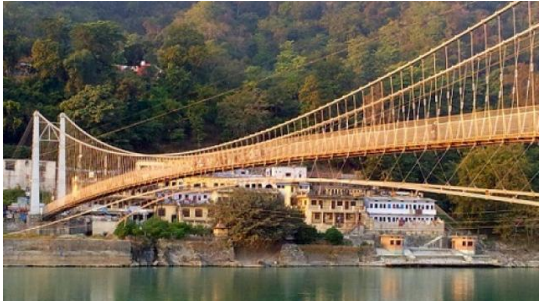
DAY 6 TRANSFER UTTARKASHI TO RISHIKESH ( 141Km / 5Hrs) OVERNIGHT : RISHIKESH