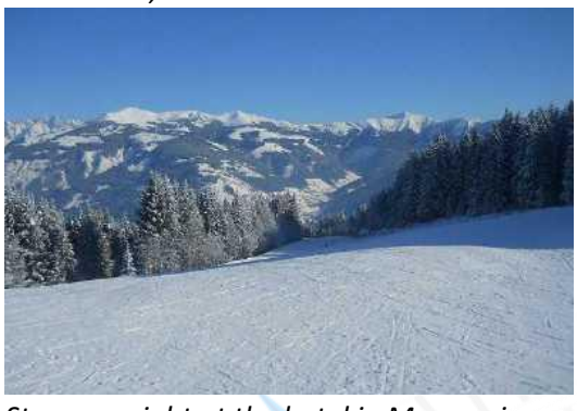
Stay overnight at the hotel in Mussoorie.

As you arrive at the Delhi airport, our representative will receive you and assists while you take a transfer to your first destination, Mussoorie.