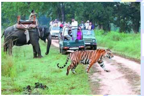
DAY 6 JIM CORBETT NATIONAL PARK OVERNIGHT: JIM CORBETT NATIONAL PARK

Later, check-out from the hotel and get transferred to Corbett National Park. One of the oldest national parks in India, Corbett National Park is extremely popular among wildlife lovers and adventure enthusiasts. The park is best known for housing a wide variety of flora and fauna. On reaching Corbett National Park, check-in at the lodge/wildlife resort. The rest of the day is at leisure and so you can indulge in the activities of your interest