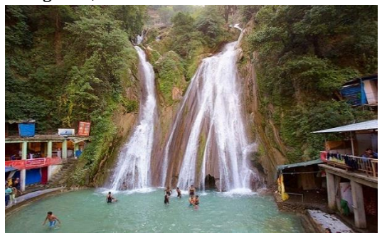
Evening back to hotel Overnight stay.

Kempty Falls: Located on the way between Dehradun-Mussoorie roads, in the Ram Gaon area of Tehri Garhwal, Kempty Falls is a beautiful cascade of water that falls to the ground from a mighty altitude of 40 feet. Surrounded by high mountain cliffs, Kempty Falls is nestled at an altitude of around 4500 ft above the sea level. This place was developed as a picnic destination by John Mekinan owing to its captivating surroundings and scenic beauty. One of the most renowned waterfalls in Uttarakhand, Kempty Falls offers a mesmerizing panoramic view as the water falls from the mountains