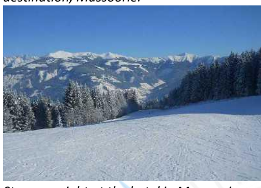
Stay overnight at the hotel in Mussoorie.

As you arrive at the Delhi airport, our representative will receive you and assists while you take a transfer to your first destination, Mussoorie.