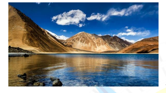
1 Night at Pangong Lake

Pangong lake is a landscape's most beautiful and expressive feature. It is Earth's eye; looking into which the beholder measures the depth of his own nature. Pangong Lake in Kashmir is the world's highest brackish lake at 14,256 feet above sea level. In winter the lake freezes completely, despite being saline water. The Briny or Brackish water lake does not support vegetation or aquatic life except for some small crustaceans. However, there are many water birds. Altitude : 4250 M