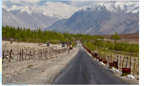
Overnight stays in Fixed Camp / Hotel at Nubra Valley