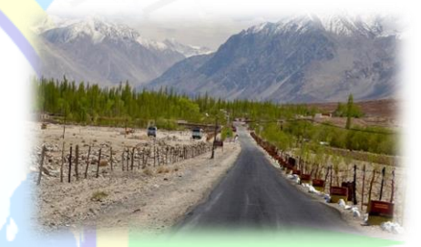
Overnight stays in Fixed Camp / Hotel at Nubra Valley