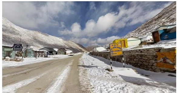
DAY 7 DEPARTURE

After breakfast at Hotel you will proceed to Airport to Catch your Flight for your onward destination with sweet holiday Memories.