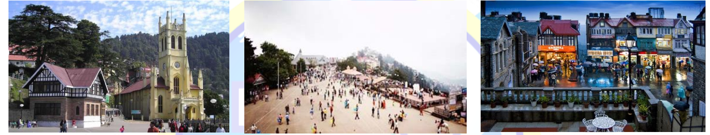
After spending some time in mall road, return to your hotel for a mouthwatering dinner. Overnight in the hotel.

After check in to Shimla hotel. Thereafter visit the famous mall road of Shimla. Visit the Scandal Point, Jhakoo Temple